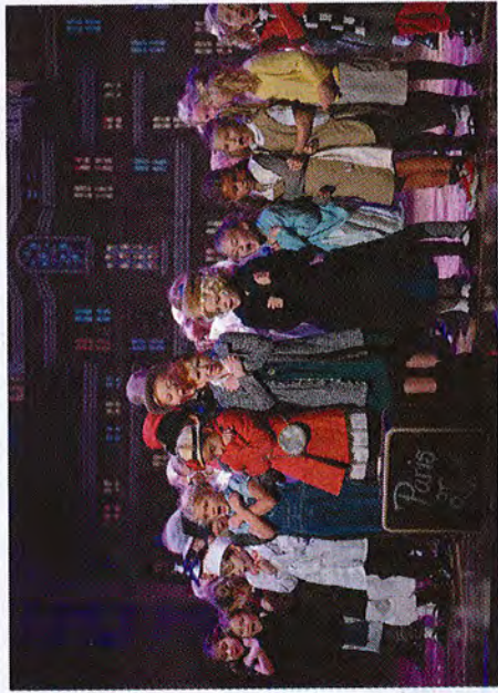
The entire Annie KIDS ensemble sing N.Y.C.